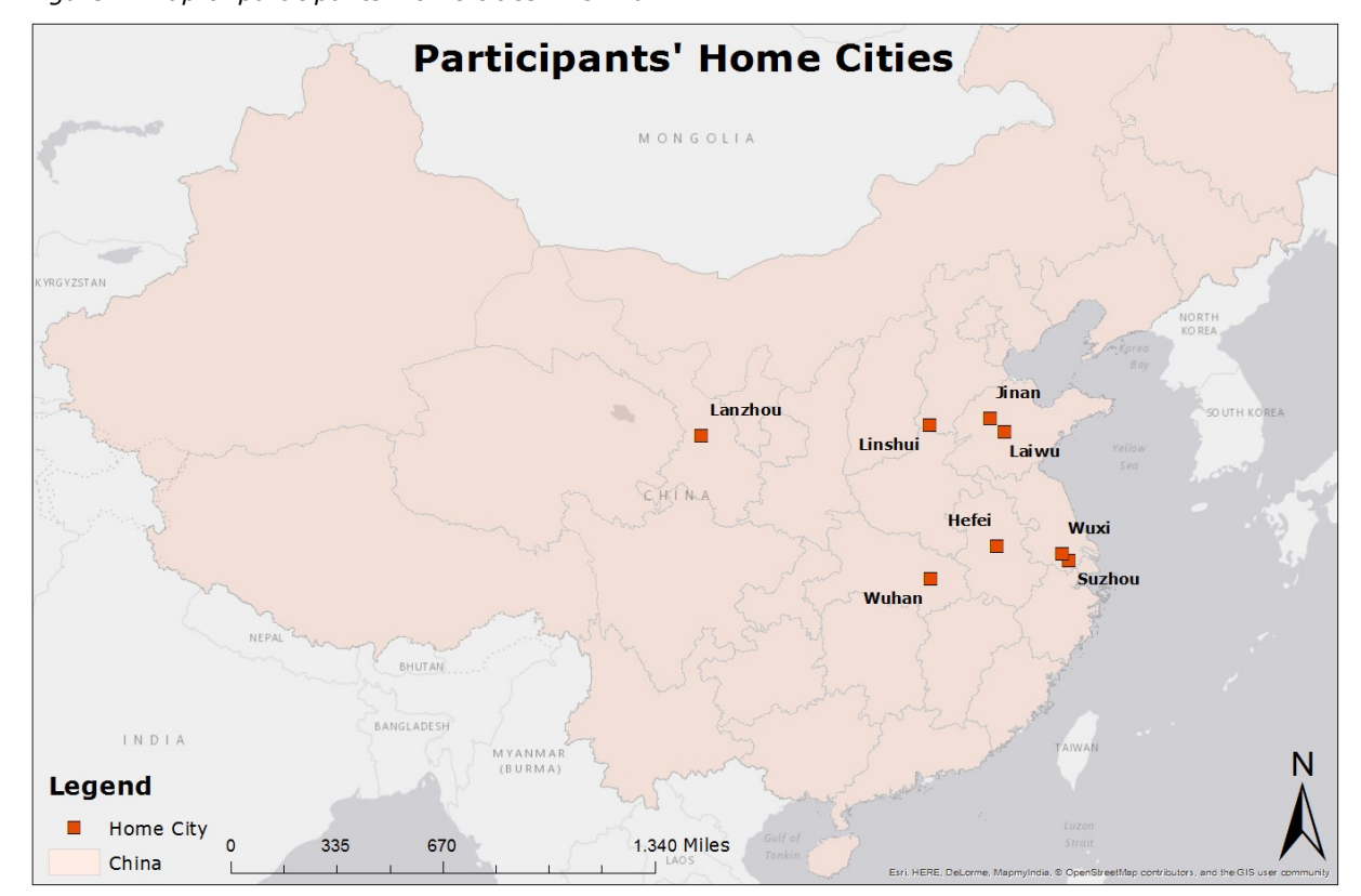
Figure 2. Map of participants' home cities in China.

In this Chapter, the results from the in-depth interviews will be discussed. The analysis of the data will be linked to the relevant theories and concepts which can be found in Chapter 2. At the beginning of every interview, each Chinese participant was asked where he or she lived in China. A map of the participants' home cities can be found in Figure 2.