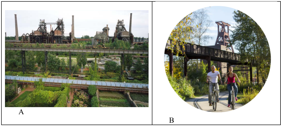
Table 5. Details of M2 (A) and Z4 (B)

Second, the addition of these new narratives can ultimately lead to a loss of the connection with the industrial past, conceptualized as 'deindustrialization of narratives' (Nettleingham, 2019) As discussed in section 4.1, the history presented using these industrial heritage sites is rather selective and relies primarily on the presentation of numbers and dates. Simultaneously, as described above, what is represented are relatively sanitized narratives that describe these locations as aesthetically appealing places of sport and recreation. Collectively, this could draw away attention from a history that is still valued by some inhabitants of the Ruhr or other social groups. Ambiguous histories referring to for example a past of environmental pollution (e.g. Brüggemeier, 1994), struggles of class (Berger, 2019b) or broader social struggle (e.g. Berger, 2019a) are commonly lacking. Overall, the history presented through industrial heritage is in line with AHD objectives of presenting a hegemonized history that is framed to be perceived as unambiguous and positive.