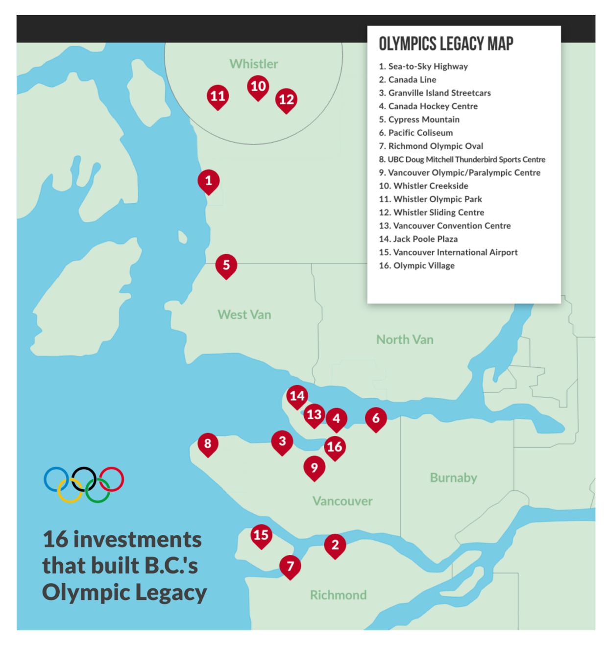
Figure 3: Map of the 2010 Vancouver Winter Olympics built legacy