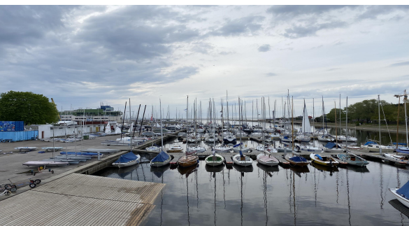
Figure 1.2. Pirita Yachting Centre current state. (National Registry of Cultural Monuments, 2021; Author, 2021)