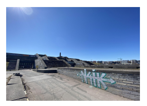
Figure 1.1 Linnahall in the inside. Linnahall facade on May the 4th.