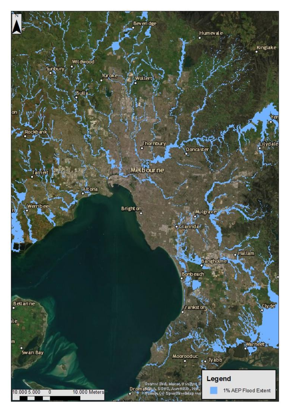
Fig. 7: Melbourne flood map (Holzer, 2021)