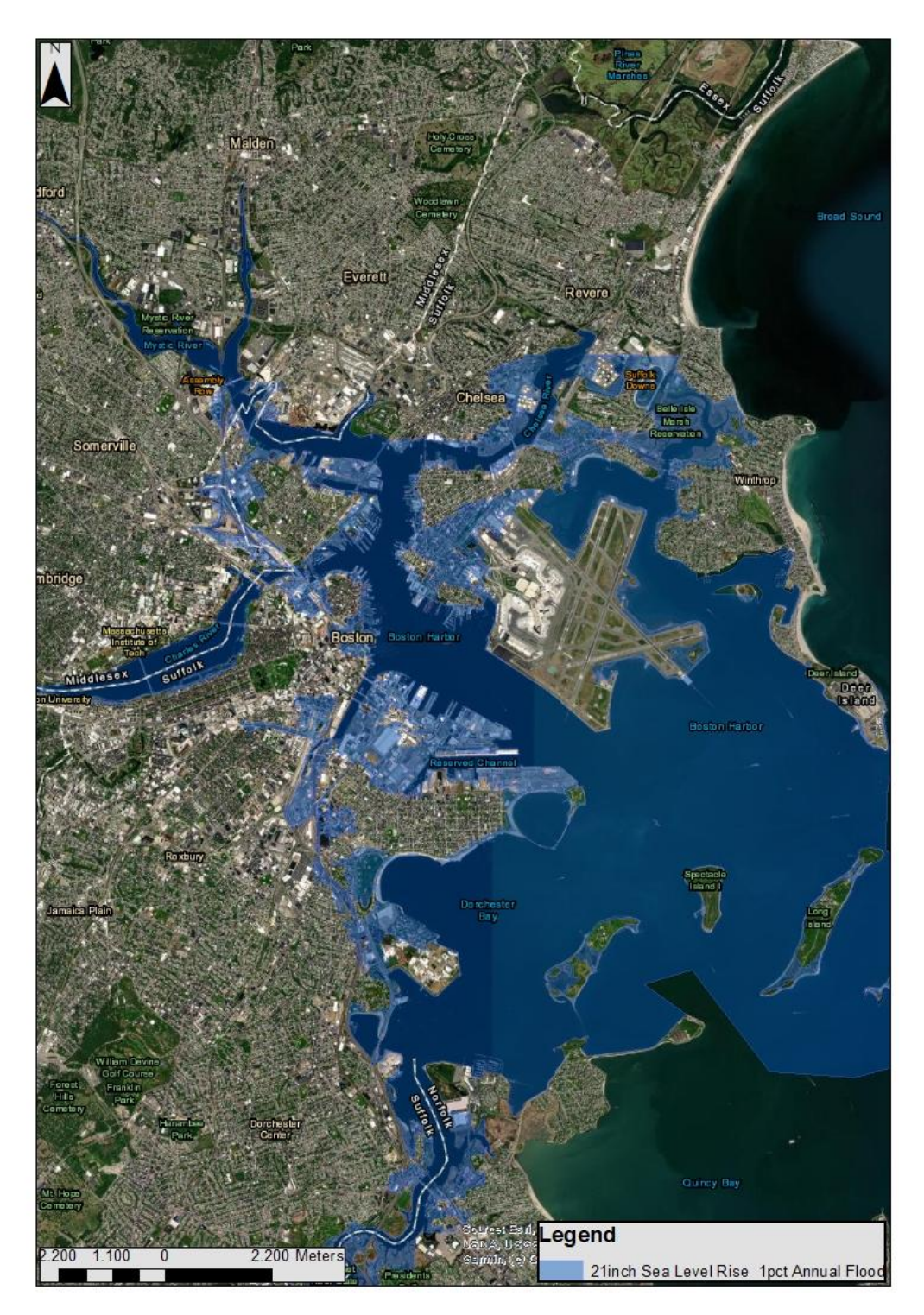
Fig. 6: Flood Map Boston (Holzer, 2021)