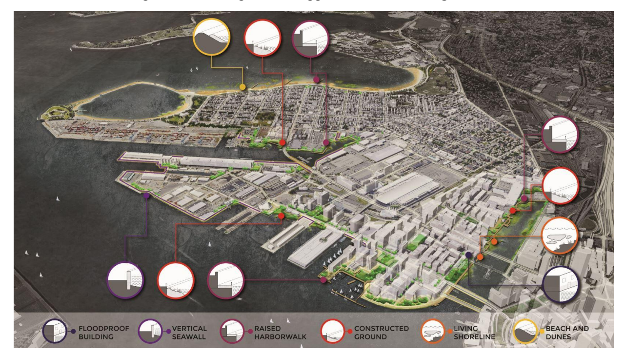
Fig.5: Water management measures in South Boston

Next to the traditional flood management measures, Boston has developed plans to prepare the city in case of flooding. The city has adopted climate-ready zoning regulations. Furthermore, building standards and regulations were set in places to upgrade local buildings to become flood resistant. Boston council has ordered the conduction of a study on flood mechanism and flood risk areas in order to proceed with a proactive approach to flood mitigation.