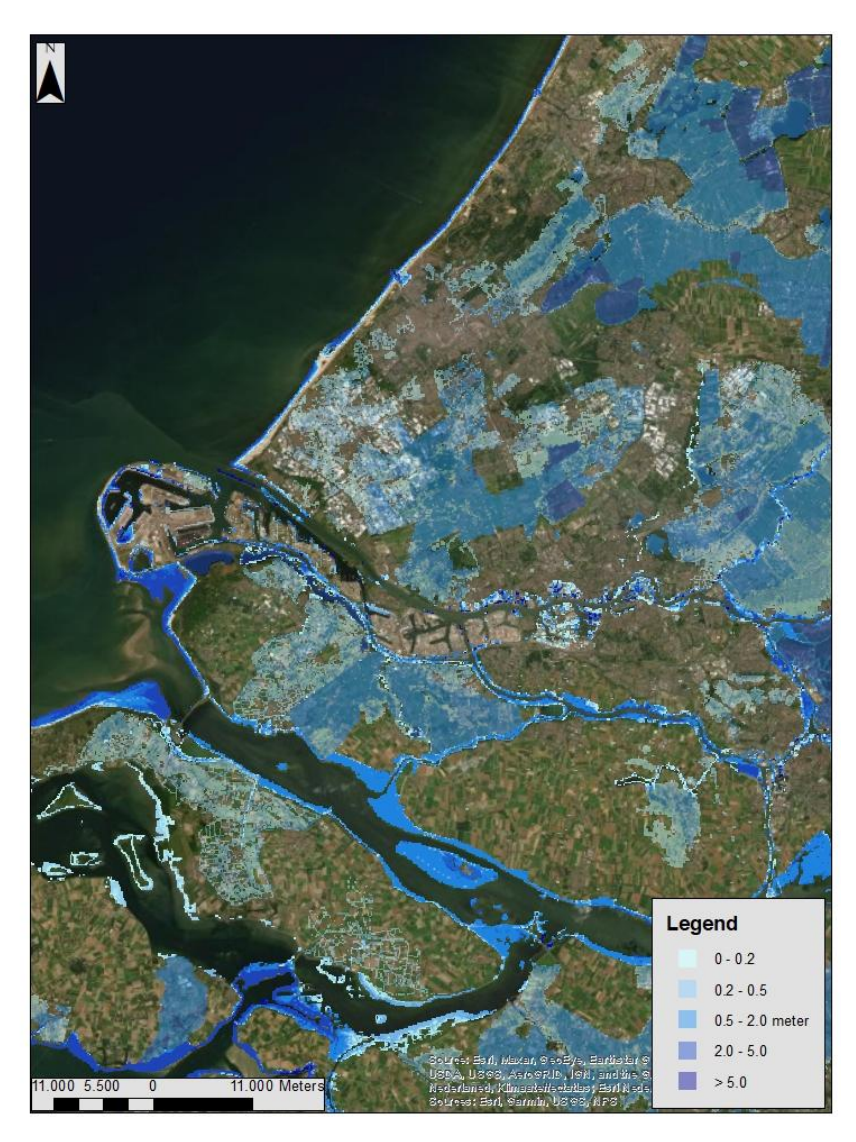
Fig. 8: Flood map Rotterdam (Holzer, 2021).