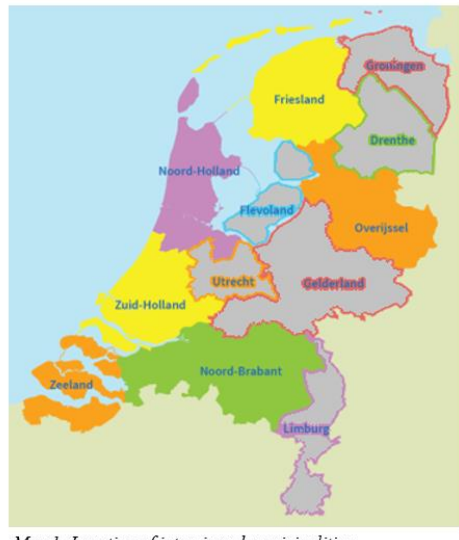
Map 1: Location of interviewed municipalities. From all coloured provinces, there are municipalities interviewed

To prevent municipalities from having many regional comparisons, an equivalent distribution of the municipalities throughout the country was chosen. This means that municipalities in the north, east, south and west of the Netherlands have contributed to the research. Map 1 shows the spatial distribution of this research. Municipalities in between the coloured areas were interviewed. As well this map shows that not in every province a municipality is interviewed, yet there is a proportional representation. To expect the interviewes to have equal knowledge, it was decided to interview policy officers with regard to housing.