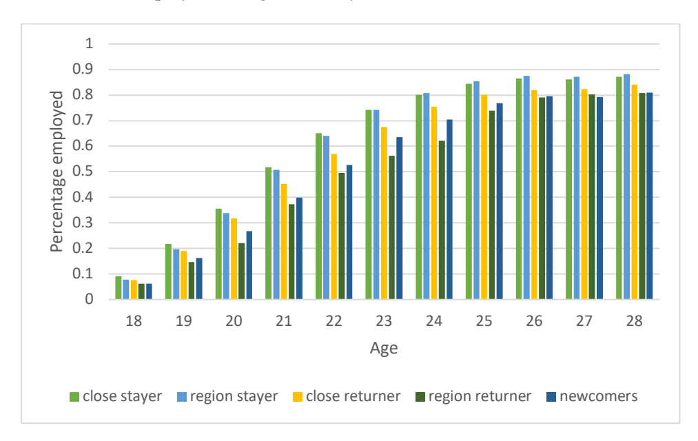
Figure 2: Employment status per age and residential history SSD Statistics Netherlands, own calculations

Examining the main descriptive statistics, Table 1 reveals a notable distribution of stayers and returners. Over 86% of the sample classifies as stayer. An additional 5% is considered to be a returner. This means that over 90% of the sample resides, at age 28, in the same municipality or within a maximum of 40 km of the municipality one resided at age 12. Small differences can be observed when studying differences in urbanity, gender and level of education. Another noteworthy observation (not in Table 1) applies to the share of individuals employed during their study, which is about 97%.