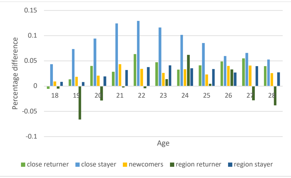
Figure 4: Employment status – Urbanity differences (rural – urban) SSD Statistics Netherlands, own calculations