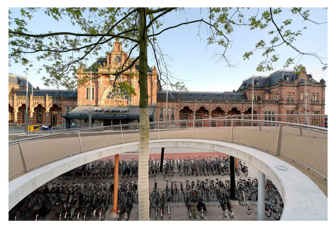
Picture 5.3: Central train station and "Stadsbalkon" bike storage (place 8 on the visual map)

looking city balcony is placed. The designer of this project really deserves to be punished. The contrast between these two is way too big. Besides, this balcony doesn't even invite people to stay there, something the designers actually saw as an important function of this place. It really is a shame".