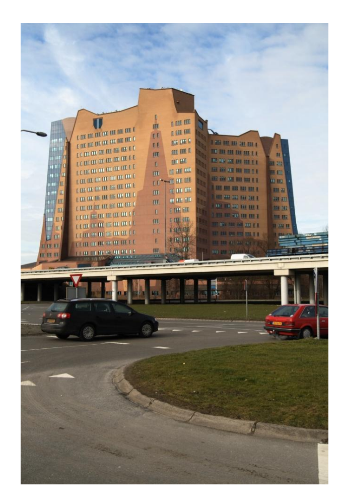
Picture 5.8: The Gasunie building (place 12 on the visual map), located outside the inner-city.

In general, the image that emerges from the respondents viewpoints show very little enthusiasm for new, radical initiatives in visual design. However, there are still new developments - especially modern, striking designs – which received positive comments. Successful examples of this kind of architecture can be found in the city as well. The Gasunie building (see picture 5.7) was repeatedly mentioned among the respondents, even though it is not situated in or near what everyone would call the inner-city. Whether it also would have been appreciated if it was situated in the inner city or not, remains unclear. The fact that now it is not situated in an historical centre, probably would be a part of constructing their positive embracement of this particular building, however this is not explicitly mentioned in the conversations by any of the respondents. What might be concluded from this, is that there are possibilities for new, daring designs within the city of Groningen, but only to certain limits: such buildings at least should not be in contrast with their environment, like the Gasunie building was located in between a highroad and a park, not in between any (historical) environment of buildings at all .This finding shows that the design itself is not the only factor which decides upon the success of new developments.