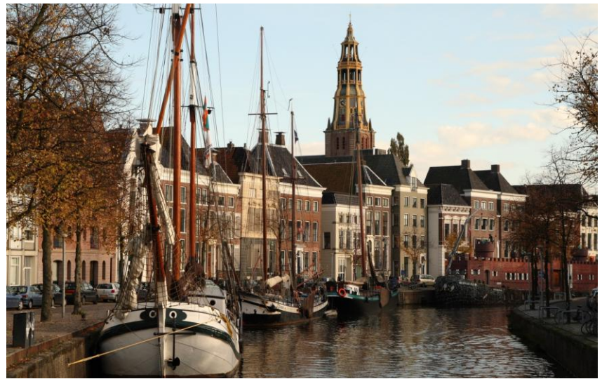
Picture 2.1: An example of protected cityscape in Groningen, Lage der Aa.

"when heritage is involved in a development plan, it should not only be a carrier of visual identity. It is also is preferable to fulfil the function of being used, besides its importance as a landmark. If these historical buildings will be used for public functions, they will receive extra meaning for the area they are in" (Boterman, 2009: 71-72) Most important conclusion, with regard to this thesis, is the idea of cities having an identity may not be ignored by developers when making new plans for the city area. In other words, they should pay attention to, and respect the contextual situation where their future design is going to be a part of. He states that developers often only have to seem eye for the representation of their own design without the context of the area it has to fit in. Another conclusion also concerns the role of designers: they should investigate in well-fitting, long term designs, instead of short term, functional buildings which provide these developers with short term benefits. This practice of "flagging" and moneymaking by architects and developers is also a topic of concern in Groningen's "Welstandscommissie" annual report on 2009, as revealed in paragraph 4.3.