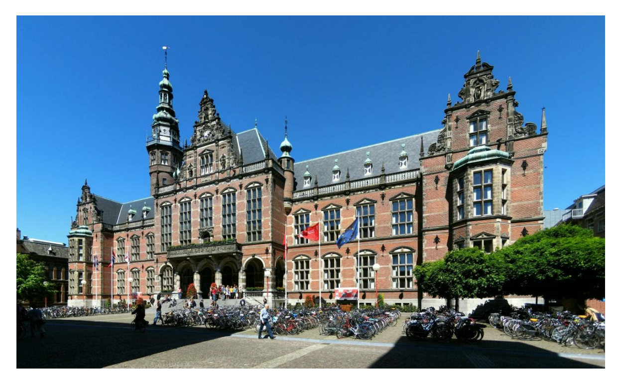
Picture 5.19: "Academiegebouw", the University of Groningen at the Broerstraat (place 15 on the visual map)

At the end of the interviews the respondents were asked to describe their ideas about what "identity" means to them, and if they would believe a city has something like an "identity". A possible definition of identity was not handed to the respondents, in order to let them feel free to formulate their own definition. By doing so, a comprehensive set of different divergent ideas was expected to receive.