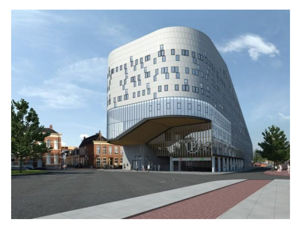
Picture 5.9:. Recently build office (place 5 on the visual map) at the Damsterdiep (Photo: "Onix", 2012)

context of new designs. Already starting in the design of new architecture, these so-called "ego tripping" architects seem to have no respect for the implementation of their design; resulting in showing their scale models within an area of "white" environment, in which the actual situation is not showed. Among the group of respondents ,a few of them mentioned this. "I believe there was no attention paid to implementation at all here… Another example of an ego tripping architect, who only imagine to plant flags, to increase their own status. In my opinion, there are too many of this kind of architects" . This quote refers to the recently finished underground car park at the Damsterdiep, with a new office on top of it, see picture 4.2.x.