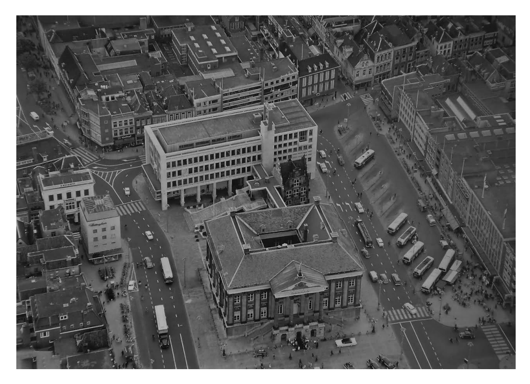
Picture 4.3: Groningen, Grote Markt before the traffic circulation program, in the sixties.