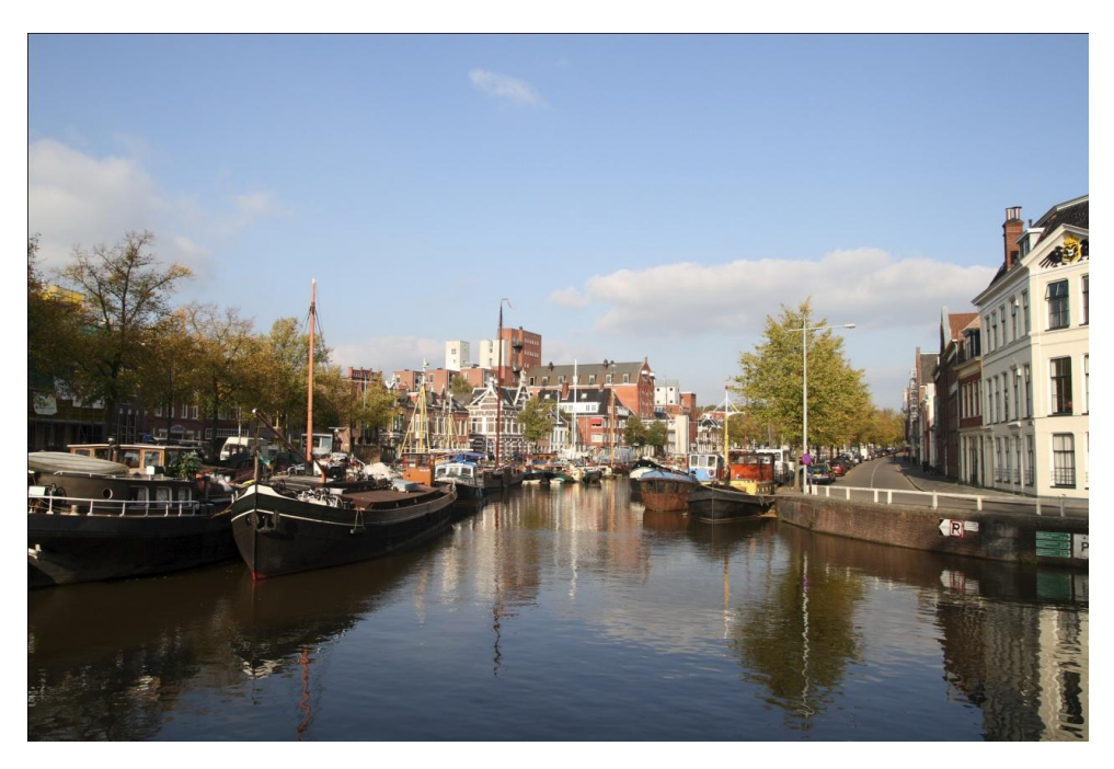
Picture 5.20: Reitdiepkade, at the Northeast side of the inner-city (place 15 at the visual map).

influence in shaping a city's identity, like New York received its nowadays identity largely on the events of 'nine-eleven'.