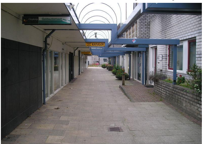
Picture 1.1. Shopping centre "Stokhorst", Enschede, elected as 'ugliest place in the Netherlands 2011'.

This topic is not hard to link with recent news topics. Recently there was a Dutch TV program "De slag om Nederland", in which viewers were asked to provide input for a list of their ugliest