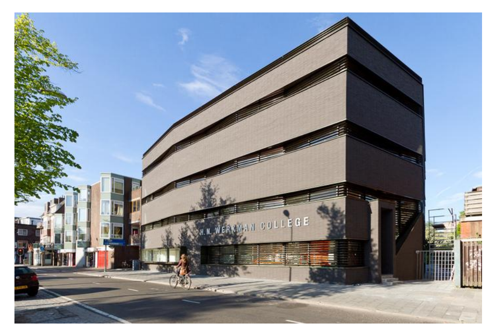
Picture 5.4:. School building of the "Werkmancollege" at the Schuitendiep (place 12 on the visual map) (Photographer unknown, 2011)