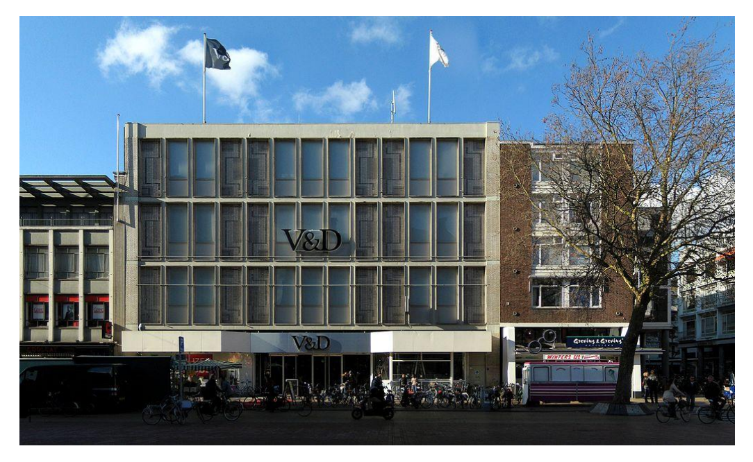
Picture 5.11: The V&D building (place 3 on the visual map) at the North-Side of the Grote Markt