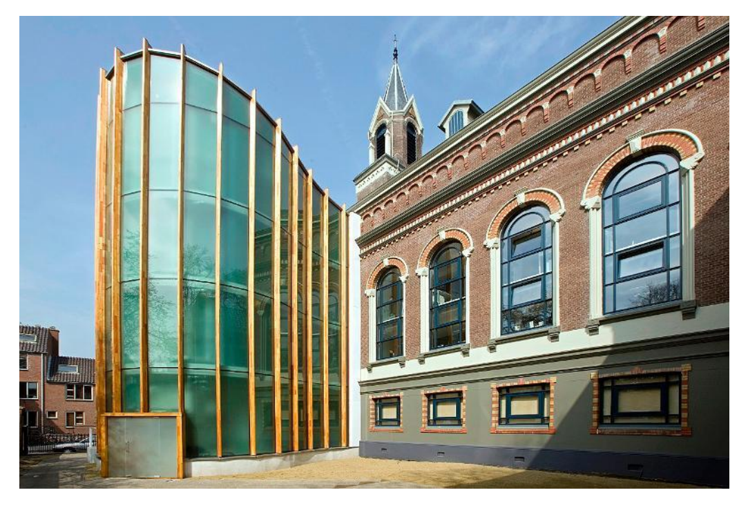
Picture 5.7: "Remonstrantse kerk" wing at the Coehoornsingel. (place 18 on the visual map)

At the very same time, there seems to be a conservative attitude with regard to design of buildings. At the one hand people don't like new architecture in area's with a historical character, and also simple designs are considered as being "dull" and uninteresting. At the other hand, there are widespread objections against daring, "obtrusive" designs. This tendency is observable among the respondents, but also is reflected in the large number of objections which were made during the referendum to survey the citizens approval for the design of the "Forum". These resistant attitudes against this extraordinary design caused a long period of uncertainty before the building activities were finally started in October 2012. Such a lengthy period of preparations may take away new incentives, according to the viewpoints of the respondents. When such new initiatives cannot count on support of citizens, this also may contribute to a – possible- process of decline in the cities appearance. When people were asked to reflect on the identity of Groningen, which is discussed later on in this chapter, one of the positive critiques turned out to be "the young and dynamic character" of the city. The described fact which reflects the objections against new developments, seems to be in contrast with the image of a young and dynamic city, which is in need of change made by new, daring developments.