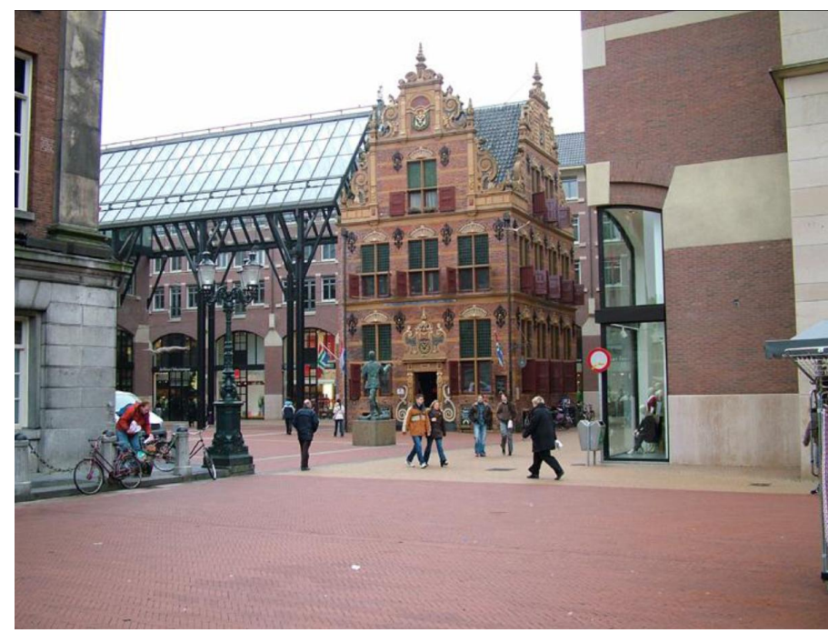
Picture 4.4 Groningen, Waagplein after demolishing old city hall. (Photographer unknown, 2006)