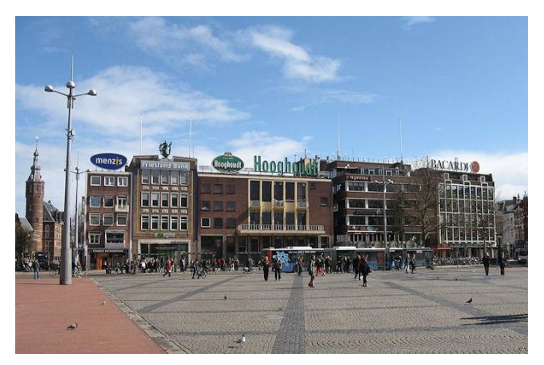
Picture 5.10.: East-side (place 2 on the visual map) of the Grote Markt

inner-city disappeared after world war two, none of the respondents mentions how the replacement with modernistic buildings was a wrong choice at that time, even despite the fact that the north-side of the Grote Markt actually was mentioned several times as a place with ugly, modernistic, buildings which should be replaced soon by something more coherent. While theoretically nostalgia also could be a reason for people to love or hate historical buildings and places, the general image emerging from the interviewees ideas do not point at nostalgic experiences at all.