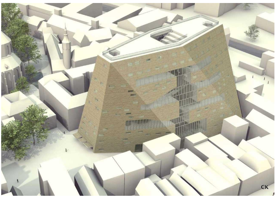
Figure 5.18: The design of the Groninger Forum (Image: NL Architects, 2008)