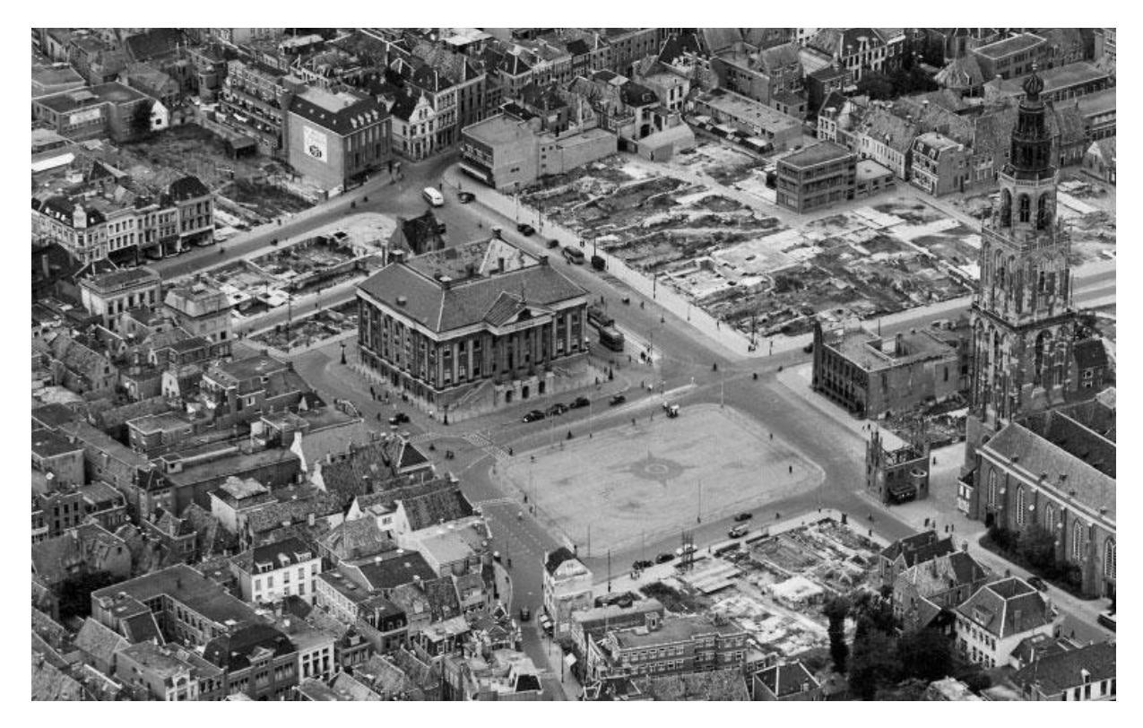
Picture 4.2.: The inner-city of Groningen after the destructions in 1948

As described before, in the Dutch case new interest for inner cities was found in the 1980's. In the previous period these areas were often considered as dismissed. In urban planning practice there has been a very strong attitude towards expansion to the city borders for a long time, together with pulling away functions from the oldest part of the city. New shopping centres emerged at city borders in neighbourhoods, and thus the perspective of inner cities was becoming unimportant. This resulted in a visible lack of maintenance: no longer were incentives for maintaining physical quality found in inner city management. This aim for city expansion also resulted in social changes: the urban area in the inner city became a less inspiring place to be for visitors and citizens. When the planning concept of the "compact city" was introduced in the 1980's, the inner city received attention from planners again.