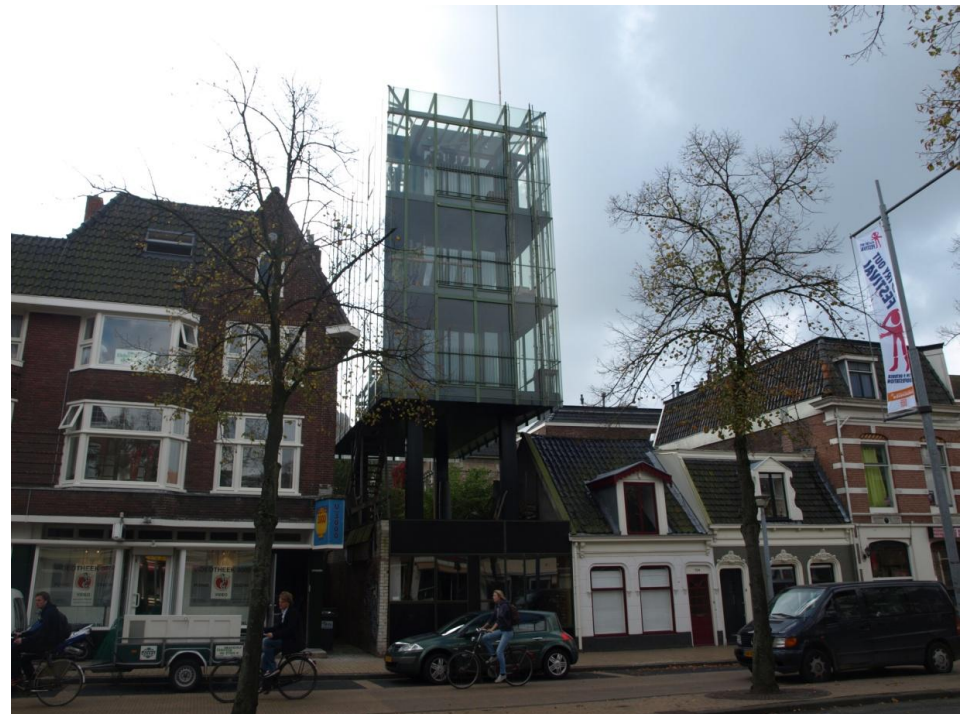
Picture 5.6: House of glass at the Gedempte Zuiderdiep, south side of the inner-city. (place 16 on the visual map) (Author Unknown, 2007)

The link with theory is hard to find, when we discuss the examples of very high contrasts leading to high appreciation. On the other hand contrasts are appreciated when they do not conflict with their context. Harmony and design was discussed in the theoretical background, with the help of Denslagen's book "Romantic Modernism" (2005). From his point of view, attempts to mix different styles into a comprehensive appearance are wrong, it brings modernism to romanticism and both worlds should remain separated. This goal of creating an incomprehensive appearance, which certainly is not the case in situations of very strong contrasts, may hypothetically be the answer to the question why some very high contrasts are appreciated, while moderate contrasts, sometimes may lead to disapproval from lay-people, in other words: things become appreciated when it is clear that it was not the aim at all to build something extraordinary next to something traditional to create a comprehensive appearance.