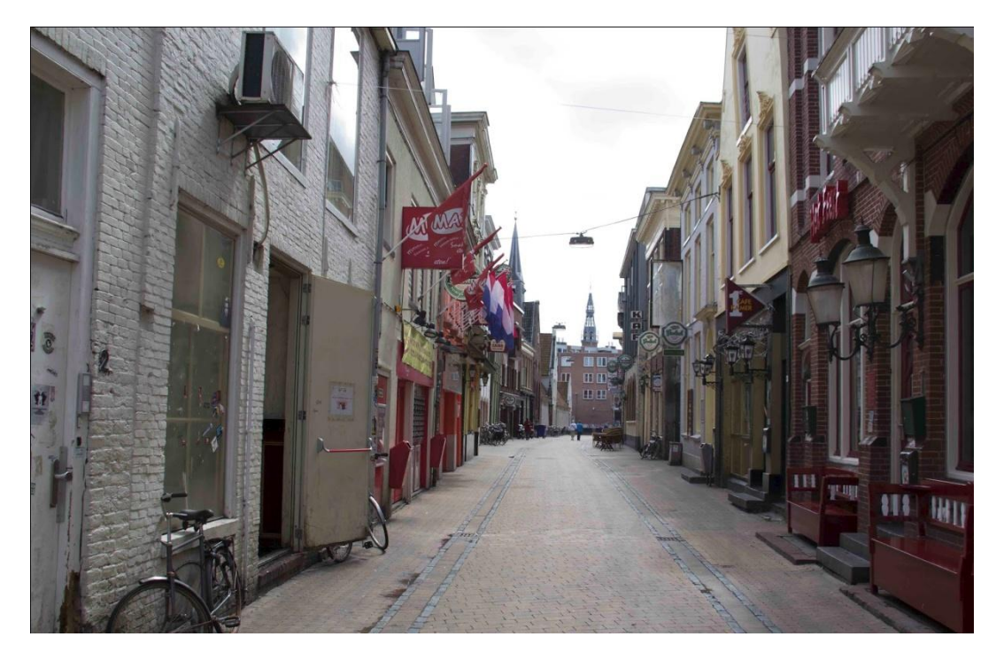
Picture 5.15: The Peperstraat, nightlife street at the southeast of the Grote Markt (place 13 on the visual map)

The importance of details in design within preserving cityscapes, were barely mentioned. Only a few respondents call fences, lights or furniture as disturbing within the context. On the other hand, the people who believe that the city would not have a different appearance without the described, still see the importance of such a protection. Almost the entire group of respondents sees the importance of having a guarantee for preserving historical values. Amongst them, the case of protectionism seems to deal with the presence of buildings (preservation or demolition) instead of protection through legislation, rules with regard to details in visual appearance. Some of the respondents also see the body of protection as an obstacle for new developments: "I seriously doubt the necessity of this policy.. the goals shouldn't be drawing on static criteria and the current cityscape, instead they should intend to guarantee the quality of the current and the future cityscape as well. Preferences, functions, citizens.. everything changes, and so does the city appearance.."