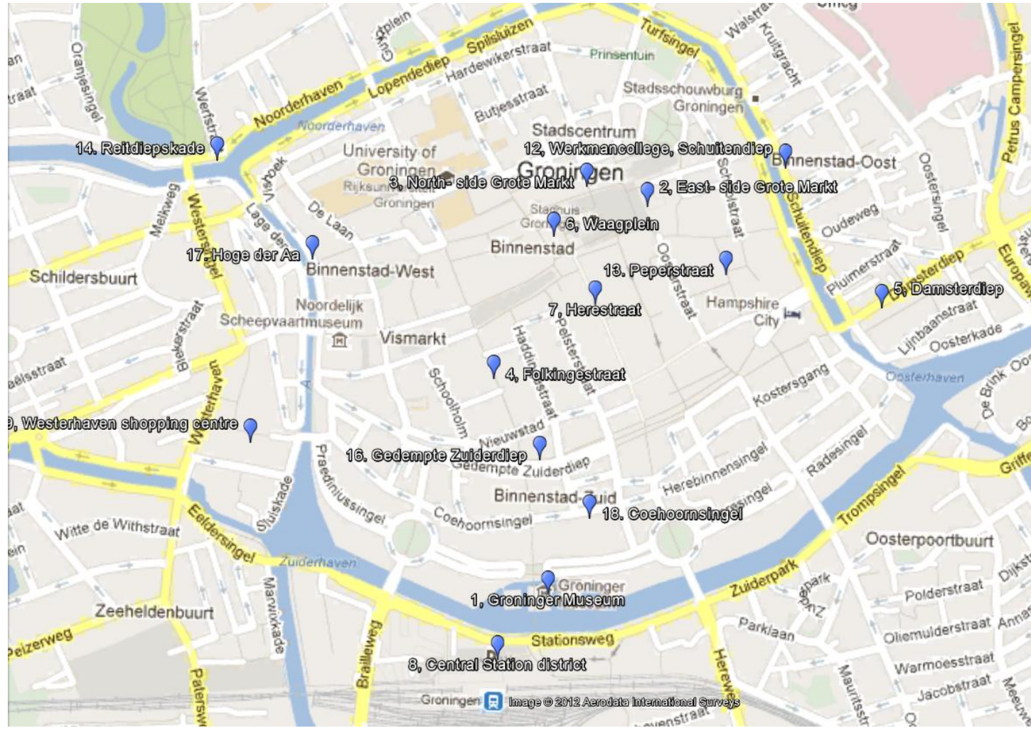
Figure 5.1: Map with places in the inner-city of Groningen, mentioned in the interviews.