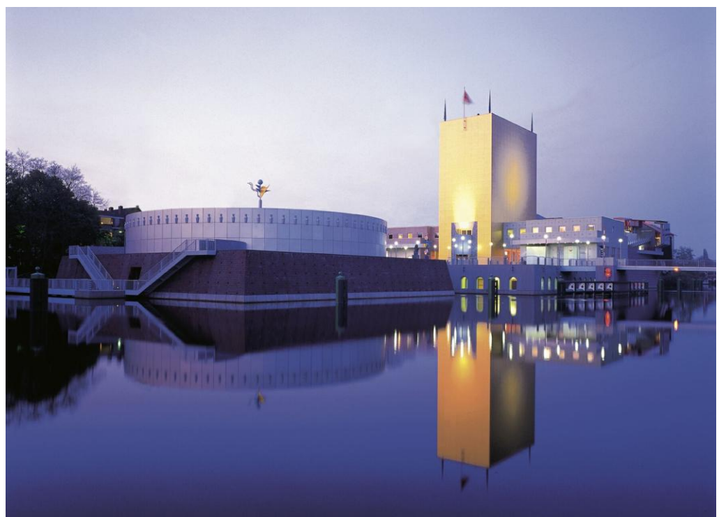
Picture 5.5: Groninger Museum (place 1 on the visual map)