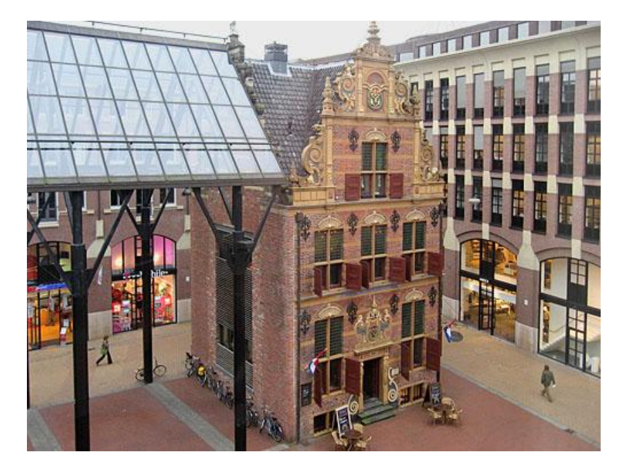
Picture 5.16: Waagplein with "Goudkantoor" (place 6 on the visual map)

Many of the respondents also do mention new developments, when they were asked about the changing appearance of the inner city. Within this framework, two projects were mentioned repeatedly. First, the project "Forum", at the East –side of the Grote Markt, which recently started with de demolition of buildings at this location. Second, the city tram project, which very recently was rejected by the city council.