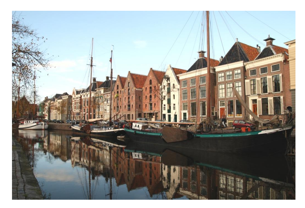
Picture 5.14: Hoge der Aa (place 17 on the visual map).