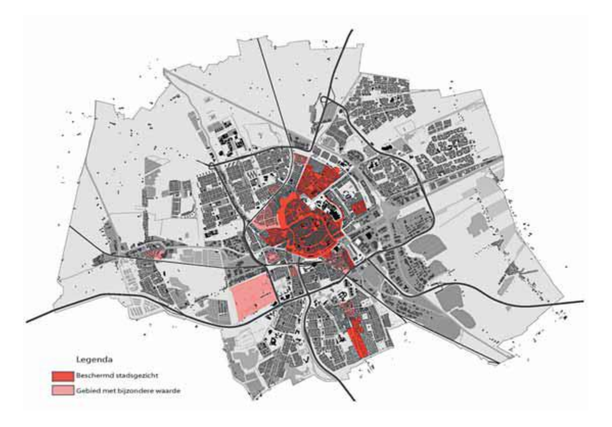
Figure 4.6: Protected cityscapes in Groningen, the red area's are part of the protected cityscape.

First, it is important to realize that the fact that this commission even exists, means the city pays value to its attempts to invest in visual quality of the cityscape; and positions itself thus as an actor to not leave decisions according to this topic open for free market and/or individual wishes of these actors. They acknowledge with this , to a certain extent, that the city is a common thing, and not a collection of individual expressions. In short, in practice it means all buildings and space marked as protected cityscape(see also figure 4.6 "protected area") are bound to rules with regard to material, colours, shapes that are allowed to use when renovating, or in the case of newly built objects. Also of importance is the coherence that must be regarded; how do new projects or renovations fit within the context? When renovations or new projects show points of discussion, it is up to the "Welstandscommissie" to assess upon these proposals and fulfil the role of a judge in these cases.