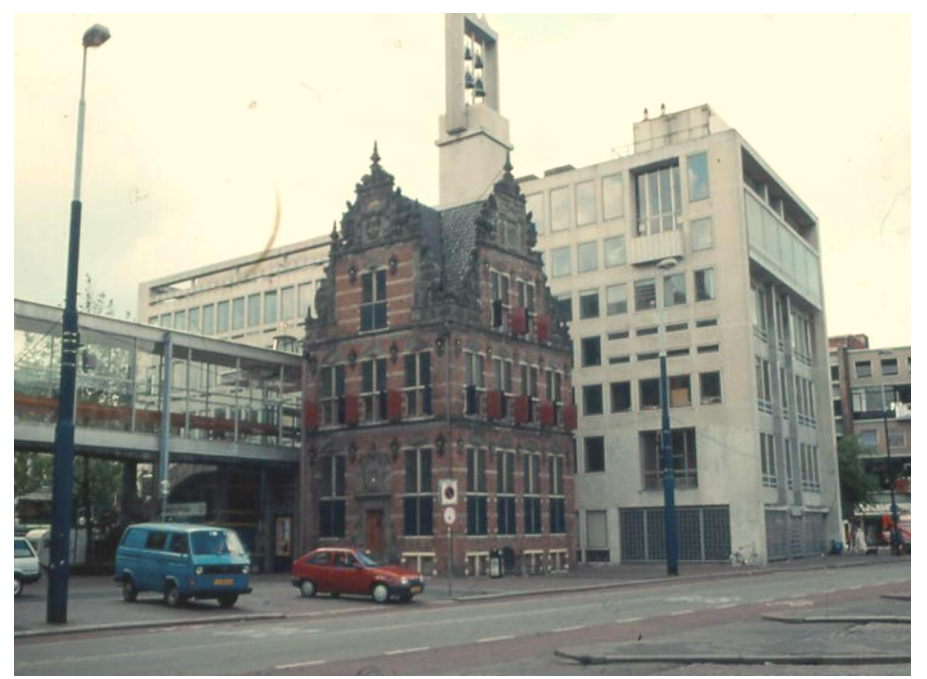
Picture 4.5 Groningen, Waagplein before demolishing city hall.